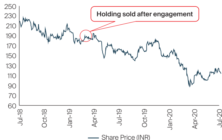
Jyothy Labs Share Price

2019 Conclusion – “It is a shame that a good business will be destroyed because the family is adamant to maintain its control, just so that each of them has something to do. A shocker of a meeting with the next CEO.”